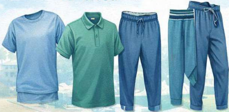
T-Shirts - Polo Shirts - Sweatshirts - Joggers