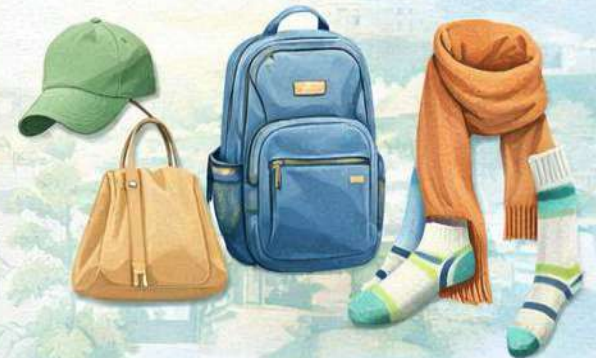
Caps - Bags - Scarves