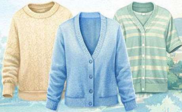
Pullovers - Cardigans - Fashion Knitwear