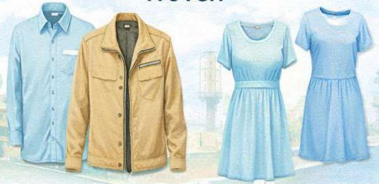
Shirts - Jackets - Dresses